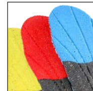
HAIX® Vario Wide Fit System