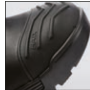
HAIX® HD Cap System