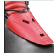
HAIX® 3Z Protector System