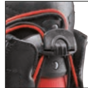
HAIX® FL Fit System