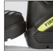
HAIX® ES Out System